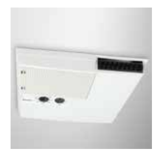
The air distribution box (sold separately) mounts on the ceiling to provide A/C controls.