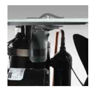
Compressor is bracketed at top as well as bottom to minimize vibration and movement while under way.