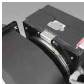
The Gold air handler's HV blower can be easily rotated in the field by loosening the single adjustment screw on the blower collar (standard AU model shown).