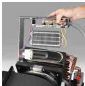
The assembly for the optional electric heater (top) and Breathe Easy air purifier (bottom) fits between the coil and blower (standard AU model shown).