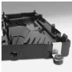
The drain pan features anti-slosh, positive-flow condensate channels, reinforced drain holes, and moveable vibration-isolation mounting clips.

The optional integrated Breathe Easy air purifier is positioned directly in the airstream and uses ultraviolet (UV) light and photocatalytic nano-mesh technology to improve air quality without producing any harmful ozone. The award-winning Breathe Easy eliminates odors and up to 99.9% of VOCs and biological contaminants.