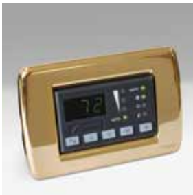
Elite keypad/display shown with Vimar® Idea bezel in gold (sold separately).

The Passport® I/O circuit board utilizes state-of-the art SMT technology and has an optional integrated CAN-bus network adapter that provides ship-wide network monitoring of multiple DX systems and air handlers. The adapter adheres to CAN-bus Standard 2.0B and is fully ISO compliant. It is available in two high-level CAN-bus communication protocols to support connection to several popular helm and cabin touchscreen control systems.