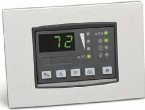
Elite keypad/display shown with Vimar® Eikon bezel (sold separately)

The Elite™ keypad/display provides easy-to-use climate control in an attractive package. It works with Marine Air's Passport I/O microprocessor-based system for the precise control and monitoring of marine air conditioning systems. The Elite keypad/display operates at 115 or 230 volts, each operable at 50 or 60 cycles.