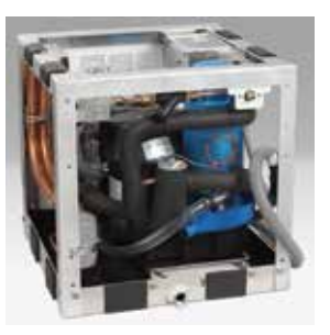
Ventilated cover panels can be removed for service access from any side.