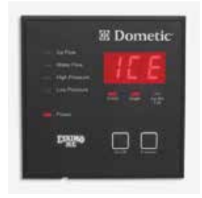
The easy-to-use Smart Logic digital control monitors all system functions.

The EI540D system installation kit includes one electrical box with Smart Logic keypad/display, water filter, and 35 ft. (10.6 m) of 3/4 in. (20 mm) ID ice delivery hose and insulation. This smaller diameter hose is easier to install and less likely to kink. Units are available in 115V/60Hz, 230V/60Hz, and 220V/50Hz electrical configurations. The EI540D will support an additional remotely-mountable Smart Logic keypad/display, which can be purchased separately.