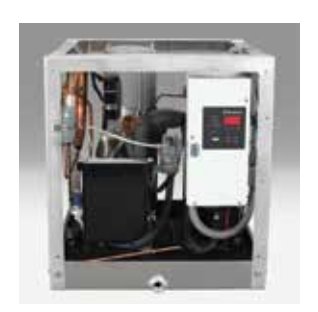
Ventilated cover panels can be removed for service access from any side.