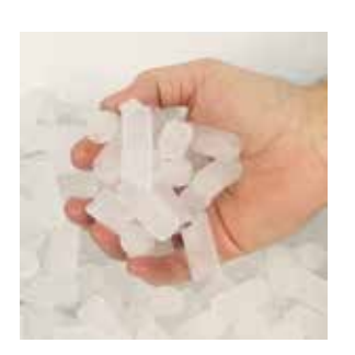
Special cylindrical ice shape maximizes ice density for greater cooling.