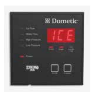
The easy-to-use Smart Logic digital control monitors all system functions.

Units are available in a 230V/60Hz electrical configuration now, with a 220V/50Hz model coming soon. The El1000D supports an additional remotely-mountable Smart Logic keypad/display, which can be purchased separately.