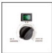
double function thermostat