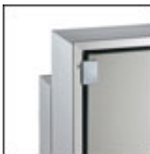
F1 version closeup