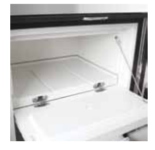
The removable freezer compartment with door has a 4-liter capacity.