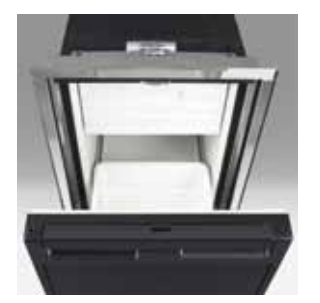
Generous 50-liter capacity and a recessed door handle for a sleek, modern appearance.