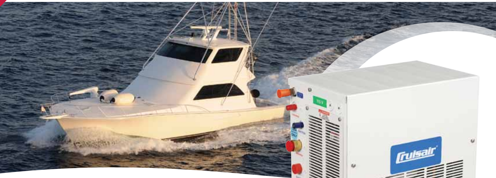
KRA025 water-cooled- only unit shown

KRA cabinet condensing units are designed for use in direct expansion refrigeration and freezer systems , such as cockpit freezers/refrigerators or catch-box chillers (not holdover plate systems), and can also be used with built-in galley freezer/refrigerators. KRA units work in conjunction with evaporator plates installed in an insulated box, or a box wrapped with evaporator tubing. Box temperatures between -5° F and 40° F (-20° C and 5° C) can be achieved with the proper application.